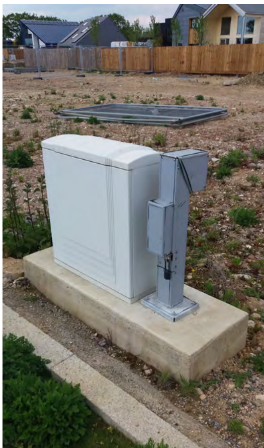
An example of services/ utilities provision at Graven Hill, Bicester providing ease of access for self-builders/ contractors. Service boxes are then removed post-construction.

7.21 It is desirable that plots also have surface water drainage, telecommunications services, and gas. The cost of servicing plots may therefore be reflected in the plot value. Servicing of plots may be carried out in phases, with key services required for plot sale and construction (water, electricity and access) provided before services requirement for occupation (sewerage, telecommunications and gas).