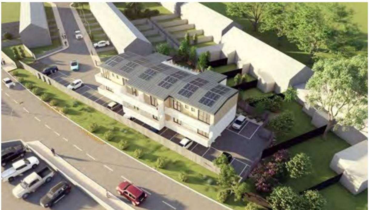
Carbon neutral, modular homes granted planning permission for 6 social rented homes at Shapland Place, Tiverton. Designed and build in partnership with modular house builder Zed Pods Ltd.